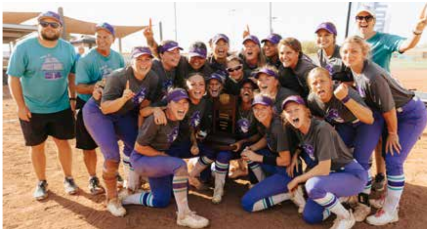
FSW softball team, winner of back-to-back NJCAA Championships