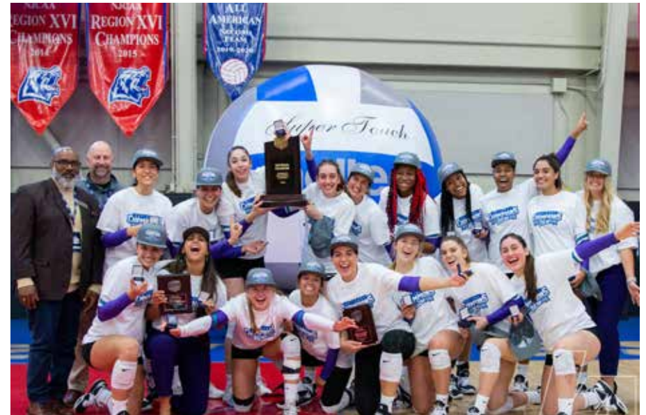
FSW volleyball team, November 2022 National Champions